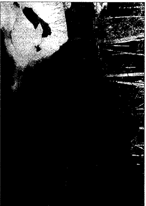
Above: The double-arched Carr Bridge in Hillsborough, New Hampshire, is a remarkable example of dry masonry stone work. A double-arched bridge allows for the necessary volume of water to flow through and still keeps the height of the bridge consistent with the roadbed. The granite was probably cut from deposits right by the river.

New Hampshire townships, the basic units of government in New Hampshire, are filled with dispersed farmsteads and homes. Nearly every township has somewhere within it a town hall, a place where the inhabitants gather one or more