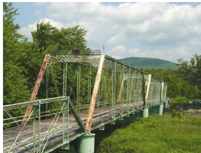
Meadow Bridge (1897), Shelburne, NH, before removal of endangered trusses to shore in 2004.

truss span nearly 74 feet long, and one short stringer