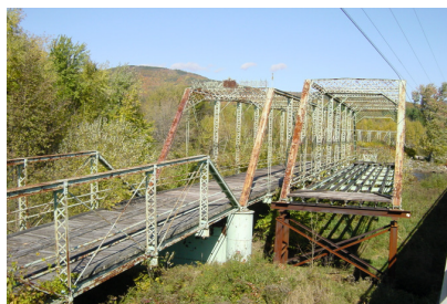
Meadow Bridge as it appears in 2008, with one river span moved to the southern shore of the Androscoggin River and the second river span visible in the distance on the northern shore.

approach span. With a total length of 504 feet, Meadow Bridge is one of the longest pin-connected bridges ever built in New Hampshire, and is one of only a few dozen multi-span pin-connected bridges to survive in the United States. The bridge is supported by now-rare cylindrical steel piers rather than by a stone substructure.